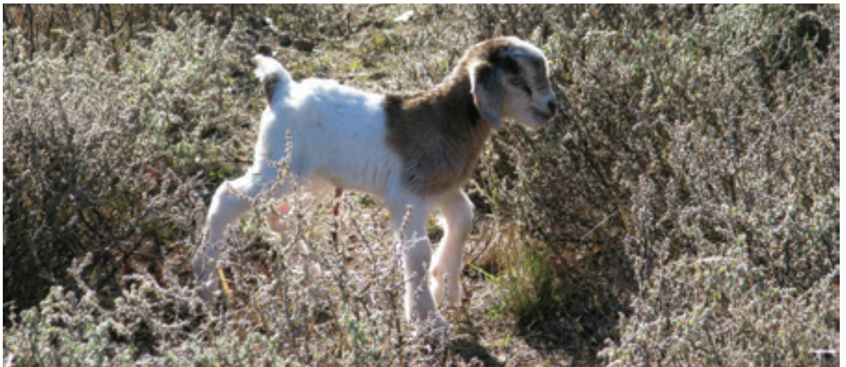
Kids are most vulnerable to predation.

Predator control is far more effective when undertaken on a regional basis with all neighbours participating in the program. Formalised producer-run dog control groups have been established in some areas. These groups coordinate dog baiting and trapping efforts and seek funding from external sources including government and meat processors, to assist in undertaking control activities.