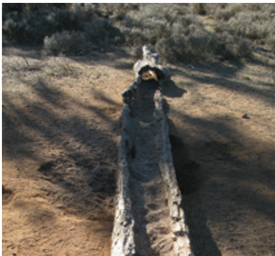
Improvised feed trough fashioned from a hollow log.

As with all ruminants, goats require roughage in their diet. When confined and fed therefore, it is important that dietary changes be introduced gradually and that this includes a fibre or roughage component. Further information is available in Module 7: Nutrition of the GiG Guide.