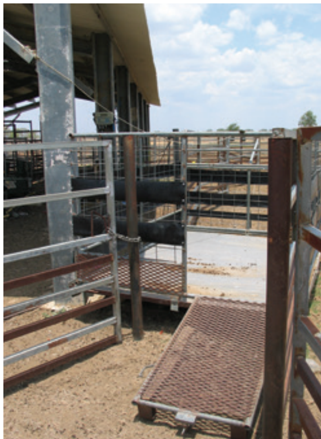
Scales such as these can be used to weigh pens of goats with the weight then averaged across the mob. This speeds up handling and improves efficiency.

Scales are an important management tool which can help determine the value of your goats and implement management strategies to maximise returns. It is advisable to weigh goats prior to sale so that you have a good idea of what a consignment is worth. Light animals that you will not be paid for (usually less than 23kg live weight and referred to as “no commercial value” or NCVs) can be identified and removed from the consignment.