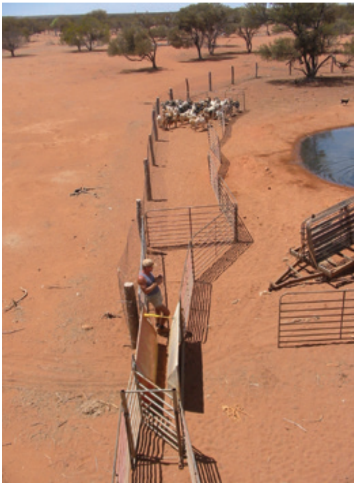
Example of a loading ramp and forcing yard incorporated in a trap yard design.

There is significant variation in fencing within and between enterprises. In wild harvest operations, fencing may be limited to several secure traps or yards compared with a rangeland cross breeding enterprise which will rely on secure stock proof fences between individual paddocks.