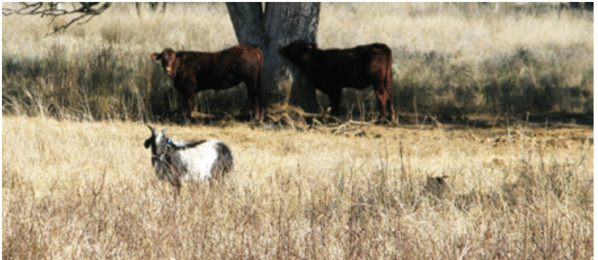
Goats can be successfully grazed with cattle and sheep.

While there is significant overlap in the diets of sheep and goats, during periods of abundance of feed, goats tend to favour browse if grasses or more palatable herb species are depleted. This allows goats to remain in good condition for a sustained period after the onset of dry times.