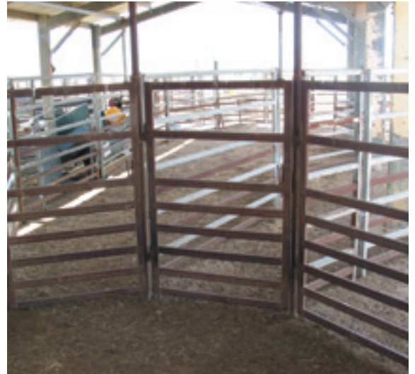
A set of purpose built goat yards.