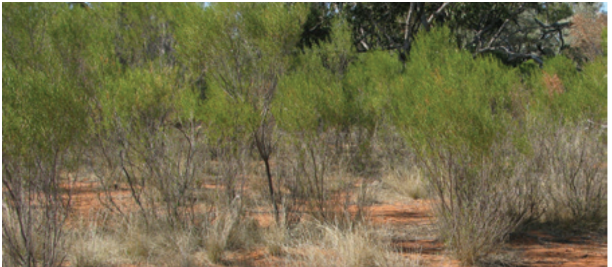
Grazing pressure demonstrated on woody weeds

This grass biomass is also used as a tool against the woody weeds to both compete with regrowth and, more importantly, to provide fuel for fire. The combination of strategic grazing with goats to allow grass biomass to accumulate and then strategic burning of that biomass has proved very successful on Gamarren.