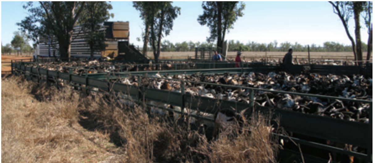
These sheep yards have been modified for goat handling through the addition of a top rail.