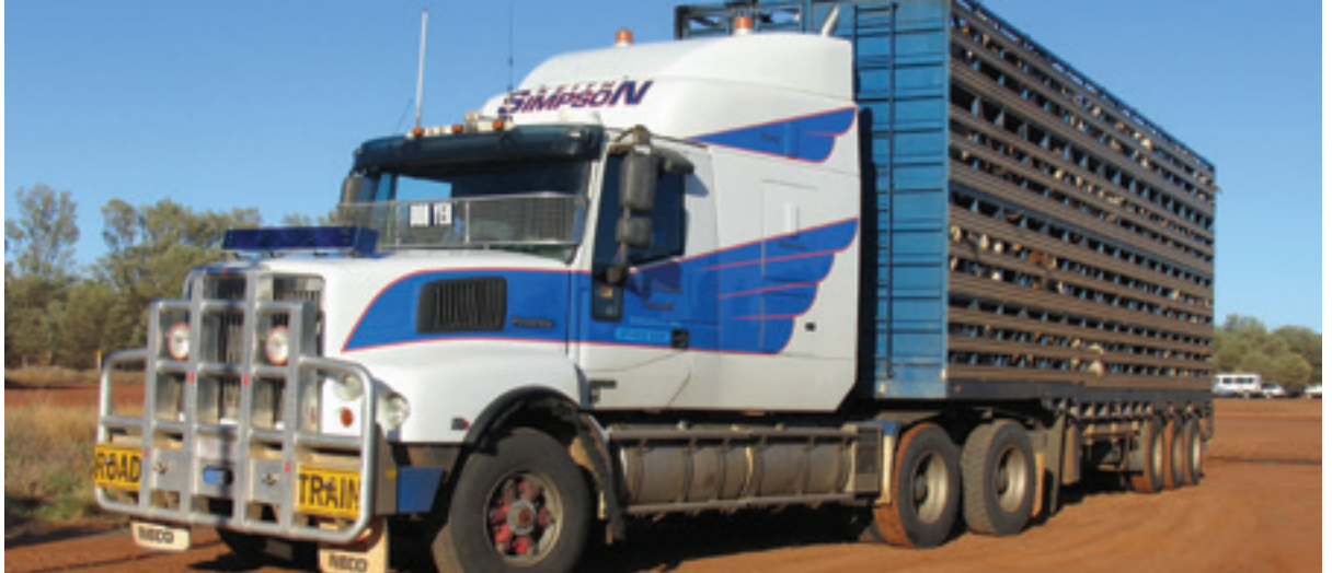
A truckload of goats ready for transport.

Transportation is a critical stage in the goat production process and one which must be carefully planned and managed. Transportation usually has a good outcome if animals are in the best possible condition prior to transport and best practice is adopted en route.