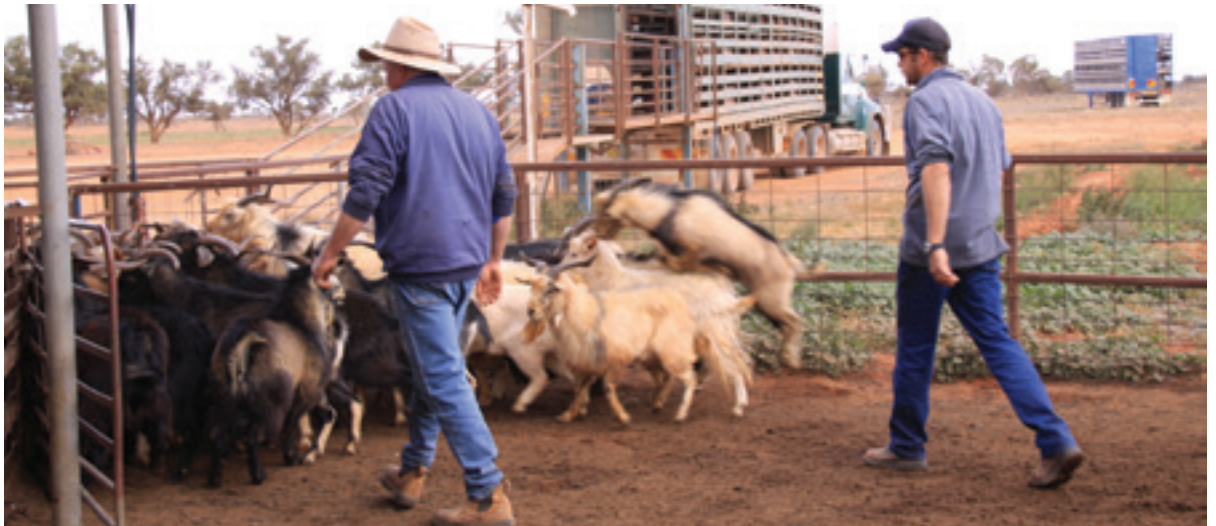
Handlers loading goats onto a truck calmly and efficiently in well designed yards.