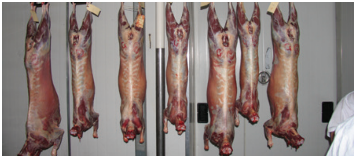
Inconsistent goat carcasses such as these can be difficult to market.