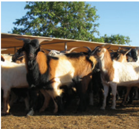
An example of shelter for goats in yards.