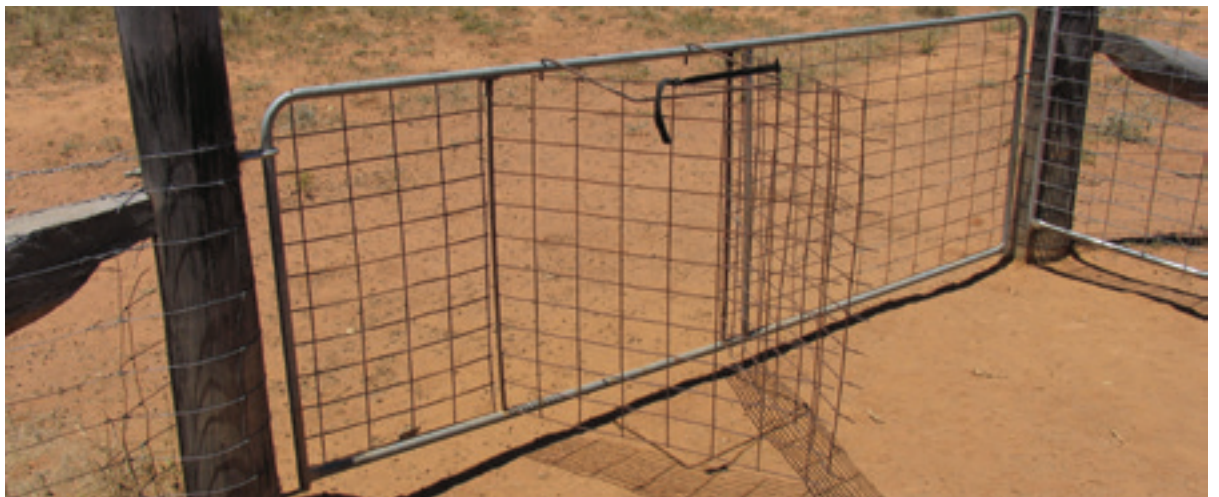
Examples of spear gate traps.

The entrance of a spear gate trap consists of a V-shaped gate with flexible spears. Goats have to squeeze through the spears to enter the yard to drink. Goats should be trained to go through the gates by gradually closing the spears over several days or weeks so that they become used to squeezing through the V. Large bucks may have difficulty squeezing through this type of gate and it is advisable to run a spear trap in conjunction with a jump-down trap to ensure higher trap rates.