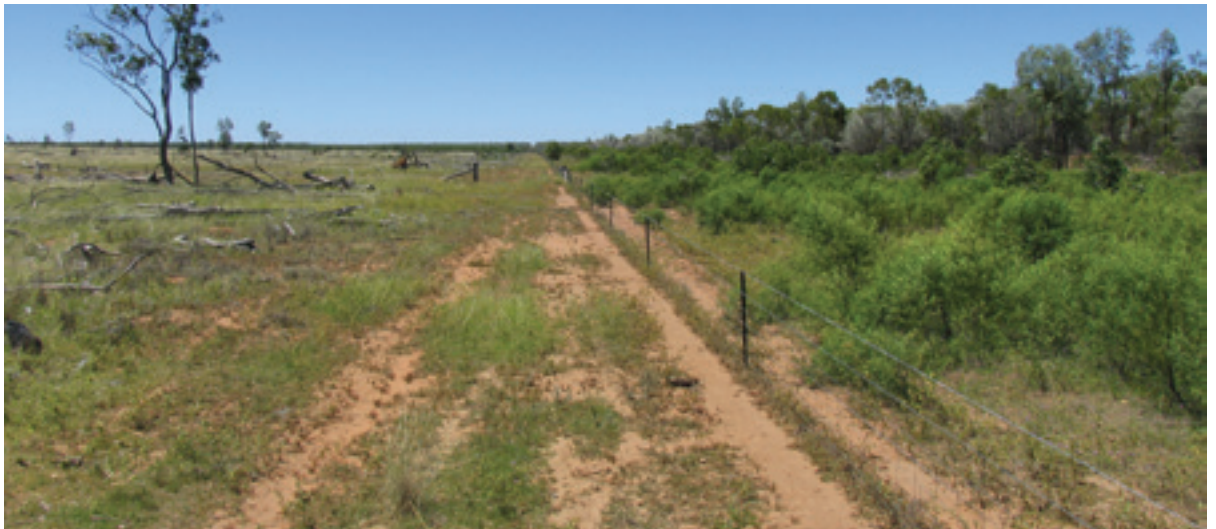
The left hand side of this image shows regrowth control through the use of goats.

Goats can be used to control weeds, such as prickly acacia; however, as high stocking rates are required to achieve control, careful management is required to ensure that other adverse effects do not follow. Weed control plans are best developed in consultation with your local government, natural resource management or catchment adviser and implemented on a trial basis covering a small area. If positive effects are observed, a wider weed control initiative may be implemented.