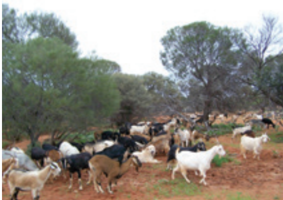
'Favorito' with young goats in the paddock