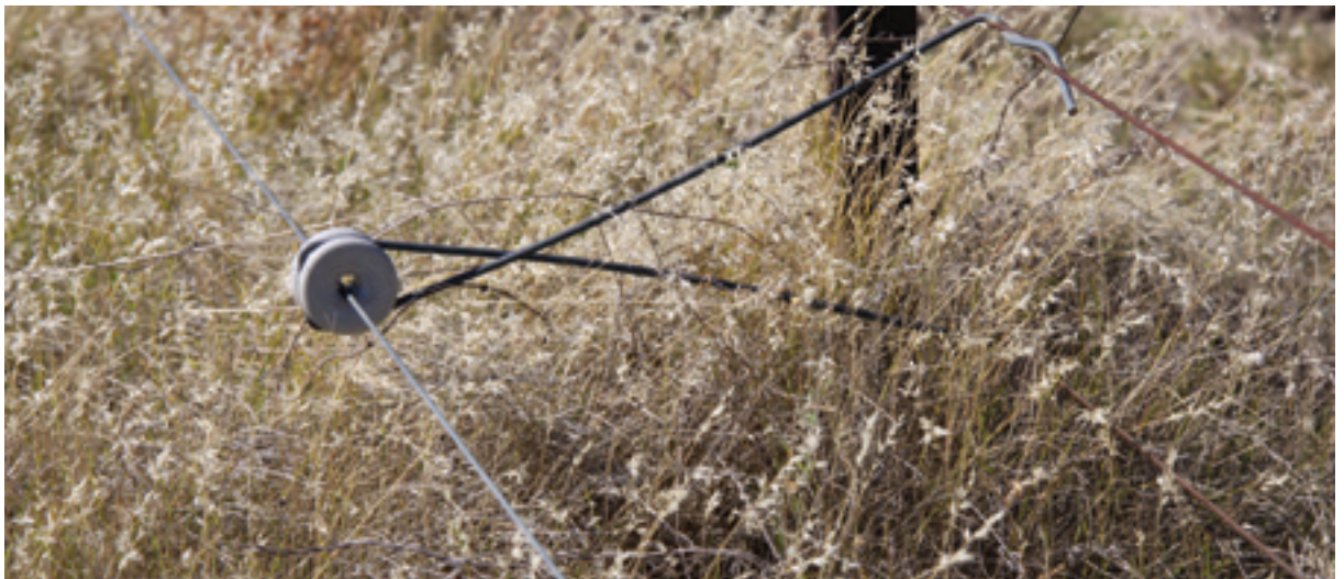
An example of an offset electric wire - 30cm out from the fence and 30cm off the ground.

Electric fencing can offer a cheap way to convert an existing sheep fence into a secure goat-proof fence. This can be done by out rigging an electric wire approximately 30cm out from the fence and 30cm off the ground. If done on both sides of the existing sheep fence, this design can also act as a significant deterrent to wild dogs.