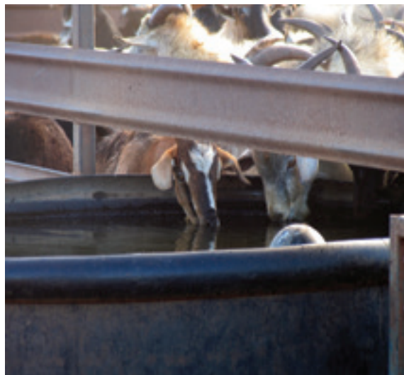
Goats should have access to fresh water at all times when in holding paddocks or yards.