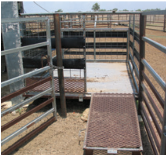
Scales at Eskdale