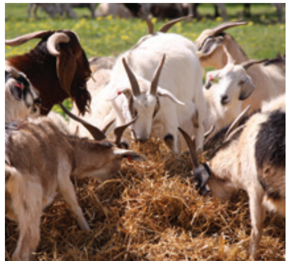
Supplementing roughage in a holding yard environment.