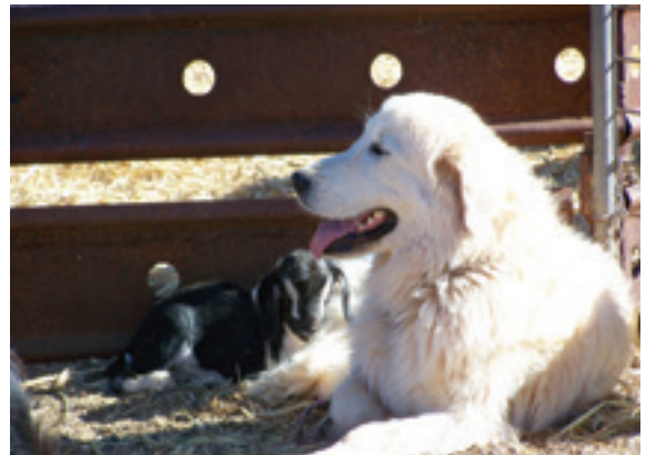
'Favorito' the Maremma with his goats