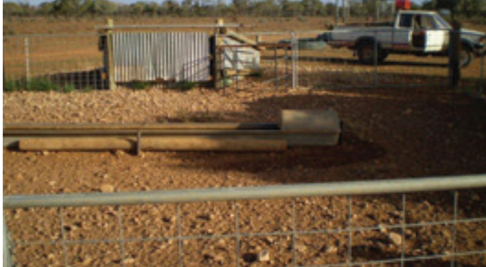
An example of a jump-down trap from inside the trap.

Jump-down traps are best suited to areas that are free of other livestock or used in conjunction with alternative access to the watering point, such as via a spear gate. Cattle and sheep that are in poor condition may suffer injuries when jumping from the ramp into the trap.