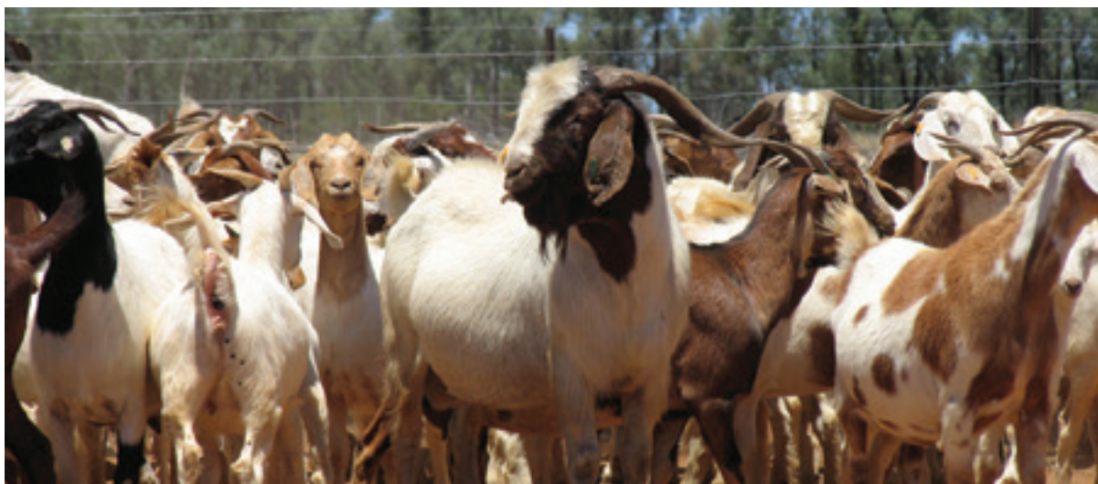
A cross breeding operation

When bucks are introduced into the enterprise, it is critical that they be acclimatised to the conditions. The safest way to do this is to source bucks from a similar environment. Alternatively, bucks should be brought in as young animals, the sooner post weaning the better and allowed to mature in the environment.