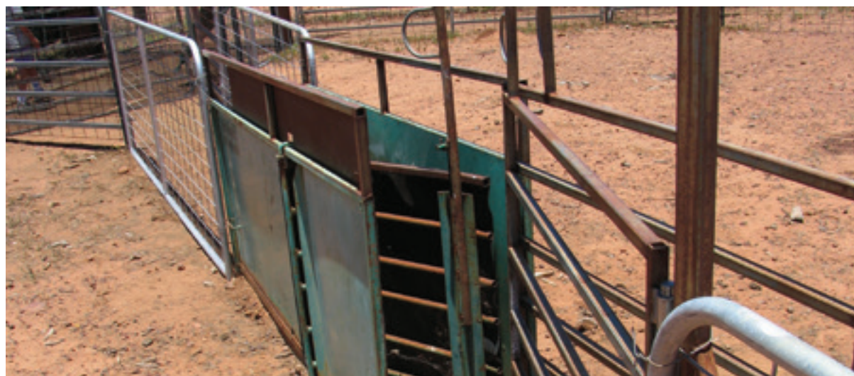
An example of a drafting race.

During drafting, rangeland goats should be handled in a manner that minimises stress and injury. Do not rush the goats; give them time to assess the situation.