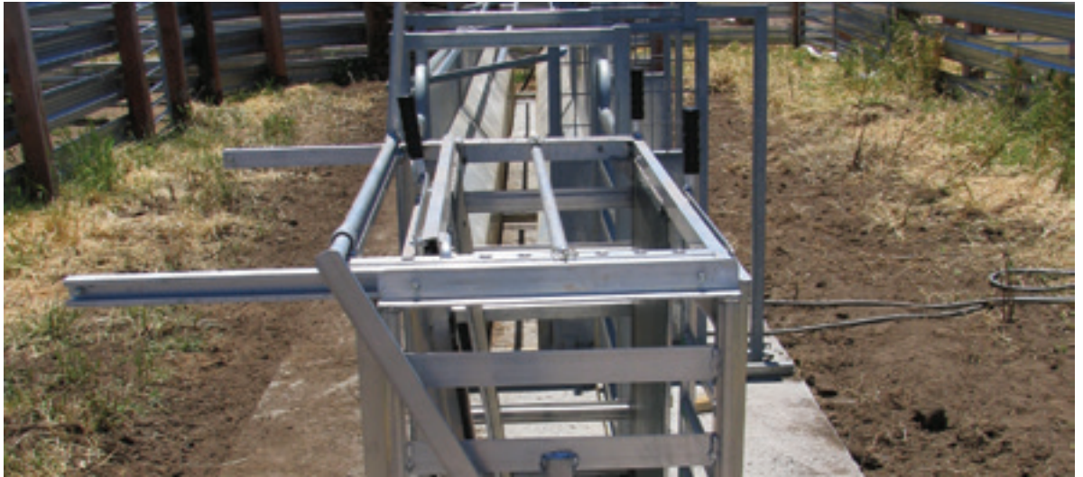
Goat handlers can either be simple, improvised devices or purpose built such as this example.