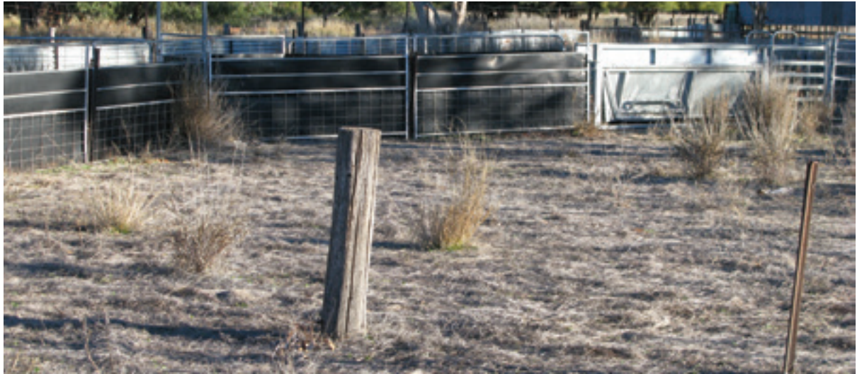
Goat yards on Dongan Plains

Tim's preferred method of restraint for goats for ear marking and tagging involves holding them between your legs. While this is harder work than using a VE machine it is much quicker with four to five staff being able to process 500-1,000 goats per hour once the system is up and running.