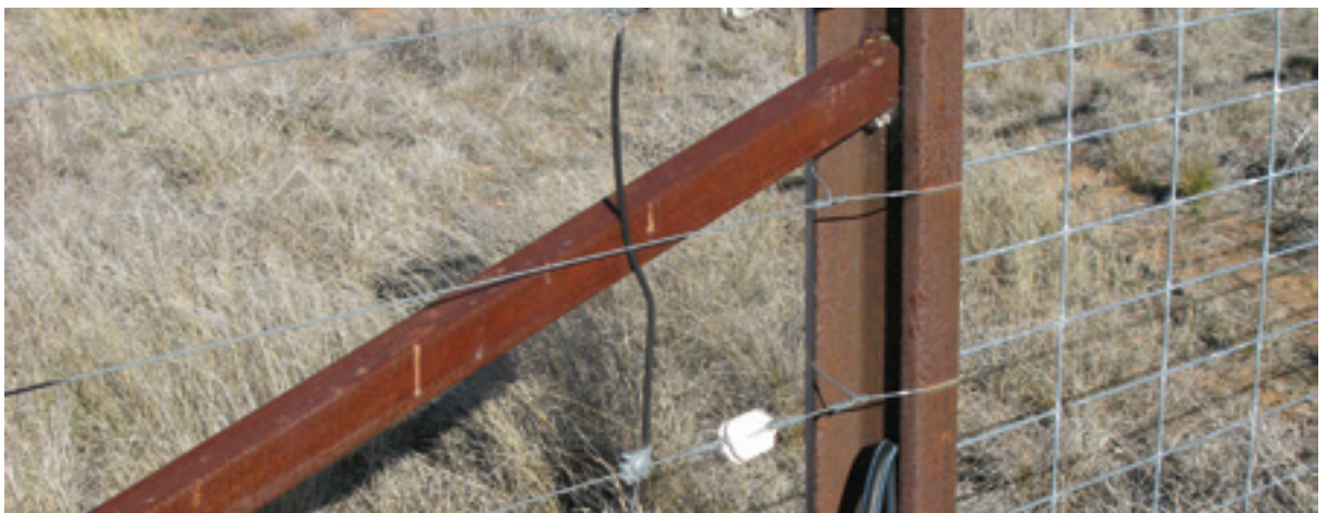
Examples of fencing on Dongan Plains

Most of Tim's goats are born in a fenced environment and respect fences. Six wire electric fencing is used and, according to Tim, these work well provided the installation is done well. Keeping power up to the fences in wet years can be challenging and fence lines are sometimes sprayed with herbicide to keep the grass down and minimise shortages.