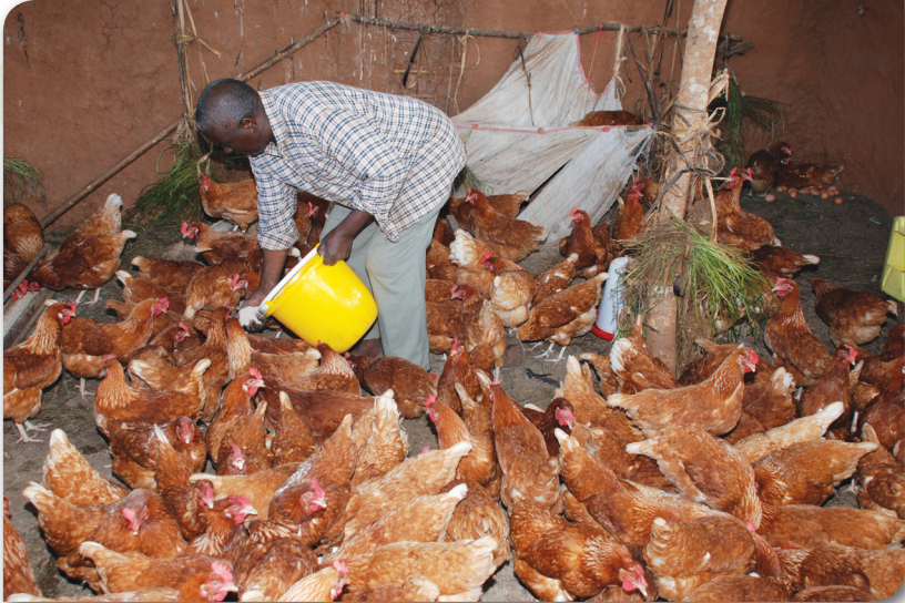
A man feeding layers