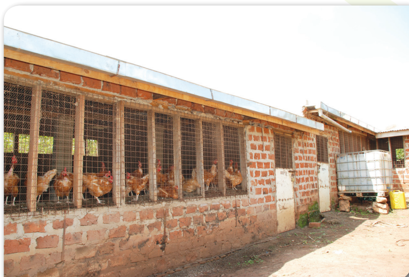
A sample of large poultry house ideal for chicken