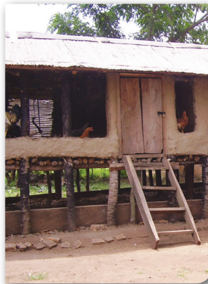
Raised poultry house ideal for local chicken